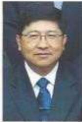
Tan: Pikom aims to establish PLC as a respected benchmark